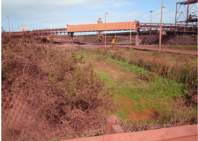
Four points photos - Eastern side of the port at ponds (Pond 1, 2 and 3) to be upgraded.

Four points photos – Southern side of the port at ponds (Pond 1, 2 and 3) to be upgraded.