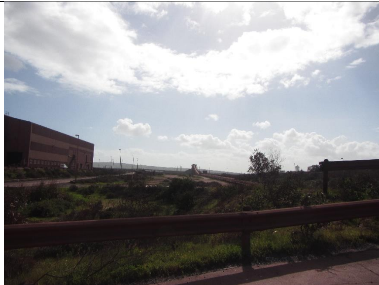
Four points photos - Western side of the port at ponds (Pond 1, 2 and 3) to be upgraded.